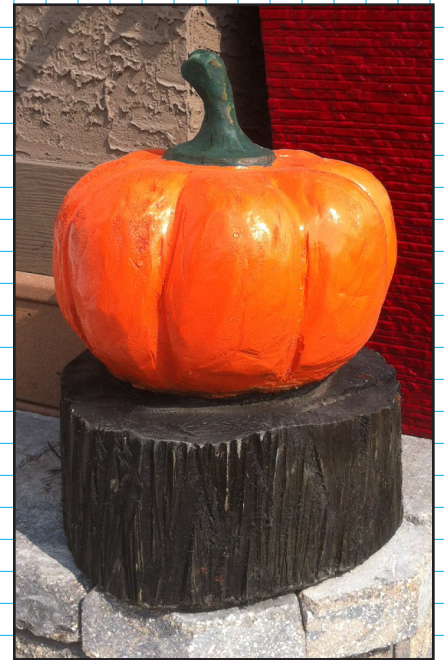
This carving has eight segments for simplification, They do not have to be equal.