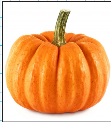
A pumpkin has ten segments that can vary in size and shape.